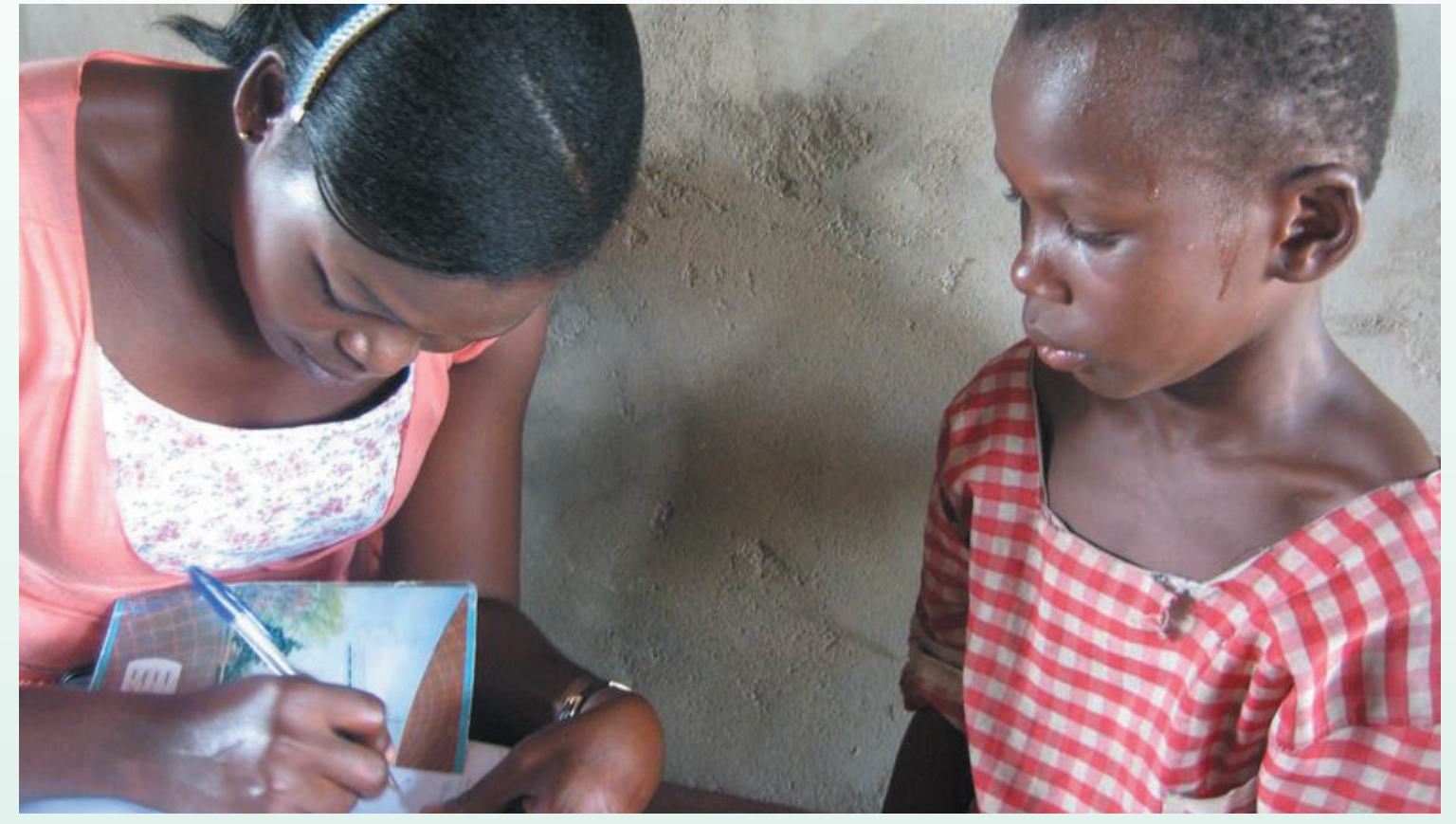
Participants will gain the skills and confidence needed to carry out effective interventions

their own work setting. Action learning groups meet regularly in order to explore ways of resolving real problems and decide on the actions they wish to take. As a means of enabling peers to learn from and with each other the process is second to none. Group members take on a higher level of responsibility for their learning and that of the other set members. This makes it more powerful and means it can have a greater impact than traditional directive training. Virtual Action Learning works in exactly the same way only instead of travelling to a face-to-face meeting our groups meet online.