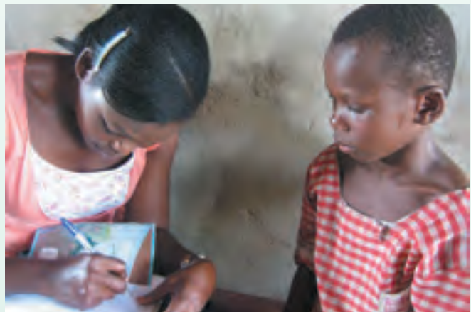
Participants will gain the skills and confidence needed to carry out effective interventions

In addition to the sessions that we offer throughout the year, WHRIN is also able to offer a bespoke training programme for individual agencies wishing to support the continuing professional development of their staff. Our courses are developed by leading professionals and can be easily tailored to meet the needs of your organisation. Please contact us for more details.