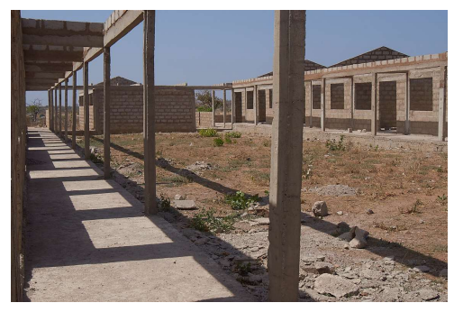
THE NEW HOME IN GAMBAGA IN 2015

In Gambaga the agency of the former first lady Lordina Mahama has bought land and erected a structure to resettle the women from Gambaga. The structure is located two Kilometres from the town in the middle of bushland. Elderly women relocated there would have no access to the market to buy or sell things. Social contacts with the inhabitants of Gambaga would cease. While the quality of the structure is good, it does not meet the privacy of adobe huts and is rather comparable to a boarding school.