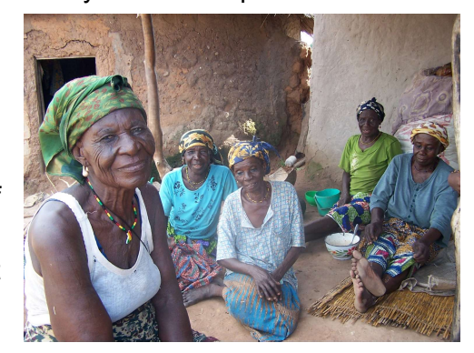
BANYASI, 2009. THE PRIESTESS (LEFT) AND FOUR WOMEN.

According to ActionAid, the female earth-priest was compensated for the closure with a motobike and a grinding mill. A road-sign was set up at the Tamale-Road. The costs of the entire ceremony can only be guessed from the pictures. They might have easily been sufficient for two boreholes at Tindang and Kukuo.